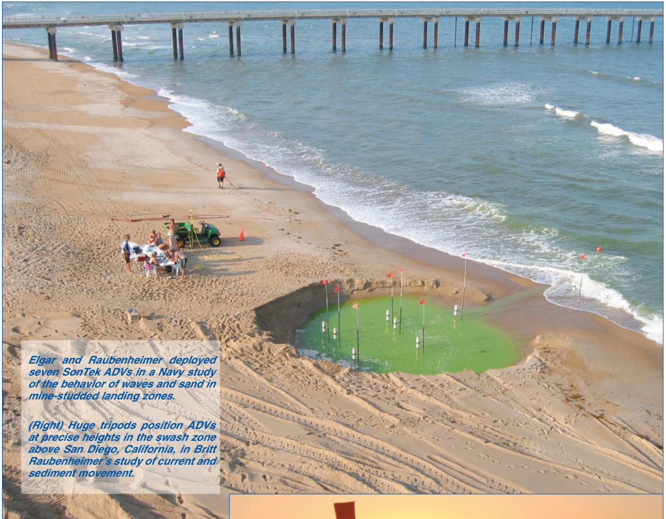
Elgar and Raubenheimer deployed seven SonTek ADVs in a Navy study of the behavior of waves and sand in mine-studded landing zones.